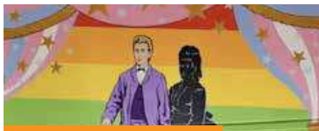
Exhibit B, Bendigo Bank Central, 3 Mitchell St.

Using performance as a foundation, I aim to further the understandings of systems of control, power and propriety. In questioning human and social worth, my concern is to redistribute discourse around authority and autonomy. My work presents both the 'passive body', and the body 'at work' - bodies that transgress both fragility and empowerment, both as the individual and as the individual within a community.