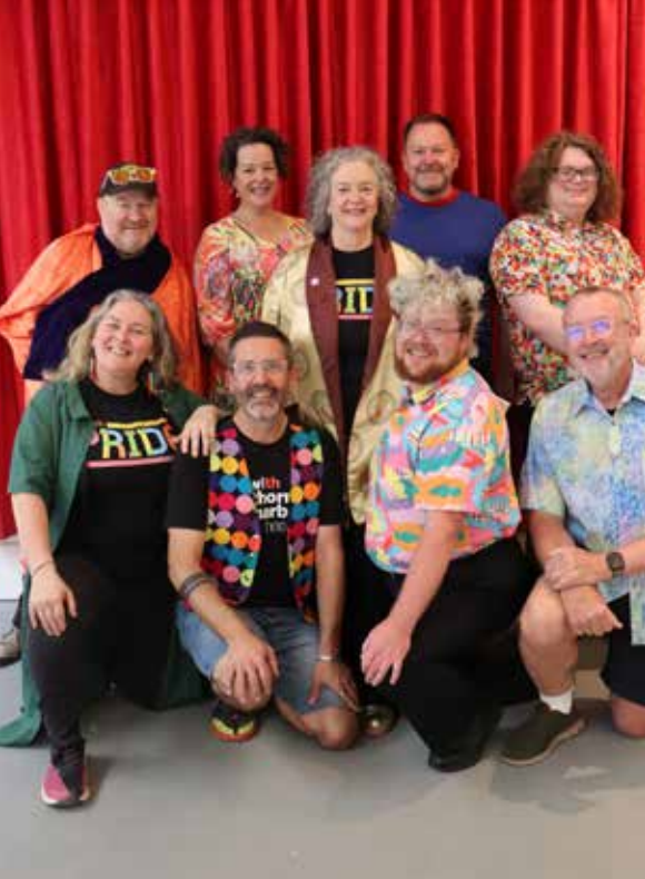
Bendigo LGBTQIA+ Community