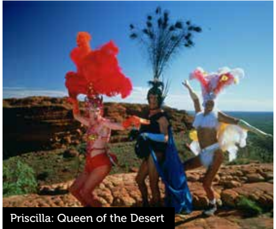
Priscilla: Queen of the Desert

Pampered pooches and their quirky owners compete in a prestigious dog show.