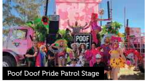
Poof Doof Pride Patrol Stage