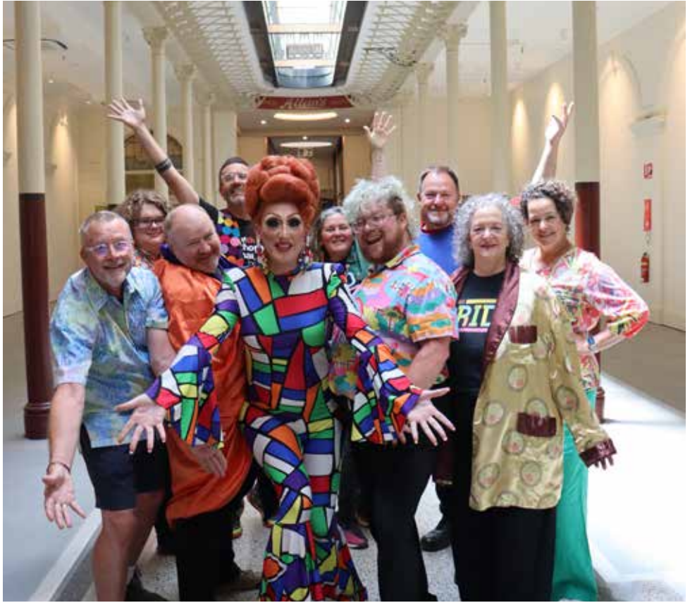
BENDIGO PRIDE FESTIVAL