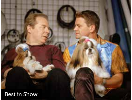
Best in Show